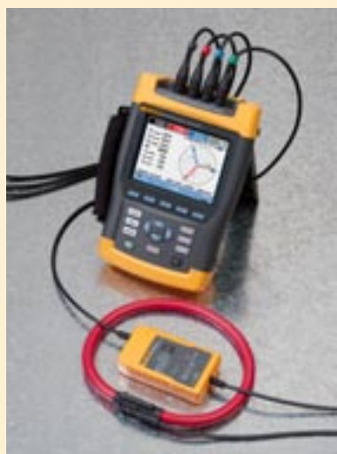
i3000s Flex connected to a Fluke 434 Power Quality Analyzer (The i430 FLEX-4PK can be used with the Fluke 434 and 435, without the need for the control box).

Note: Power supply units only available for Europe and the United Kingdom.