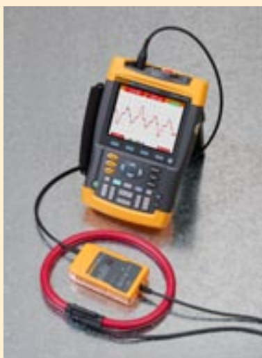
i3000s Flex connected to a Fluke 199C ScopeMeter.

Fluke. Keeping your world up and running.™